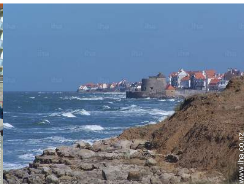
Towns close by