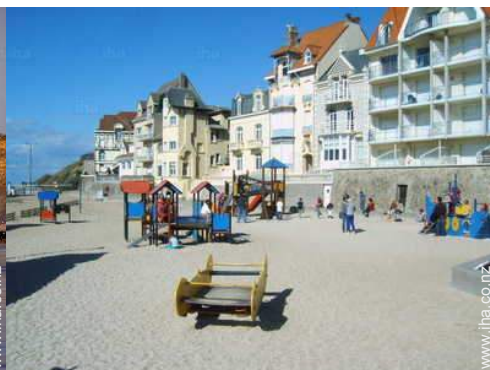
Attractions and relaxation