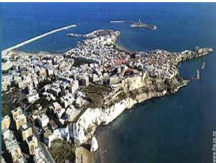
Towns close by