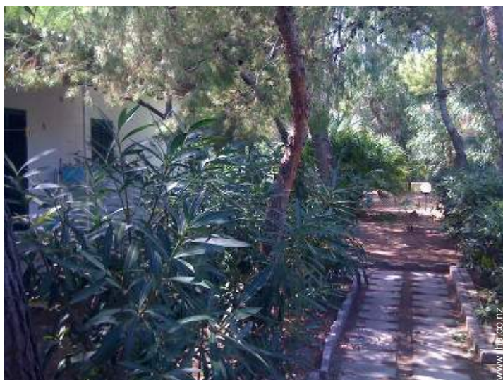
view from the veranda