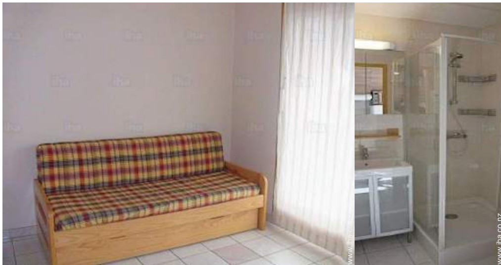
sofa bed(s) 2 pers