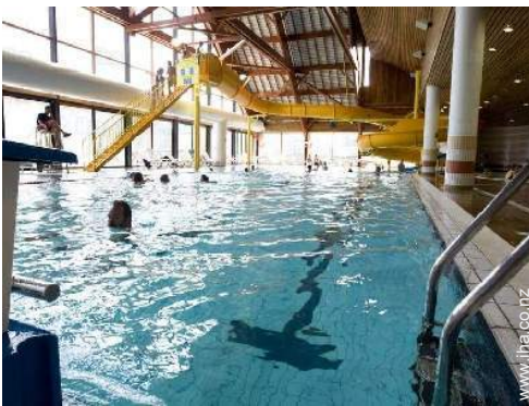
Inside swimming pool