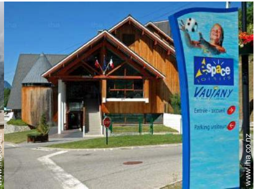
Covered swimming pool