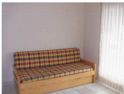
sofa bed(s) 2 pers