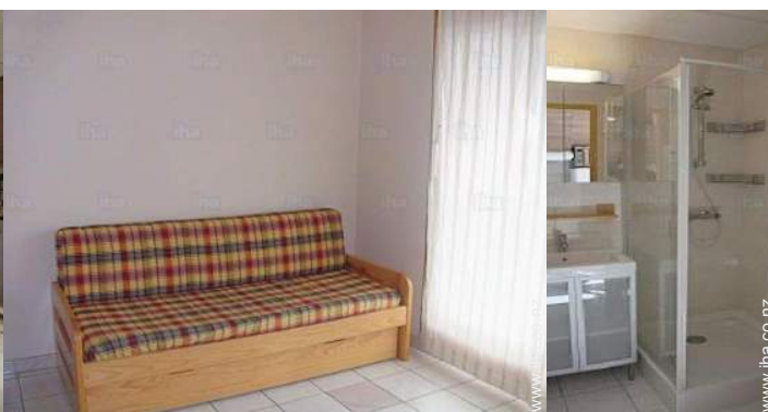
sofa bed(s) 2 pers