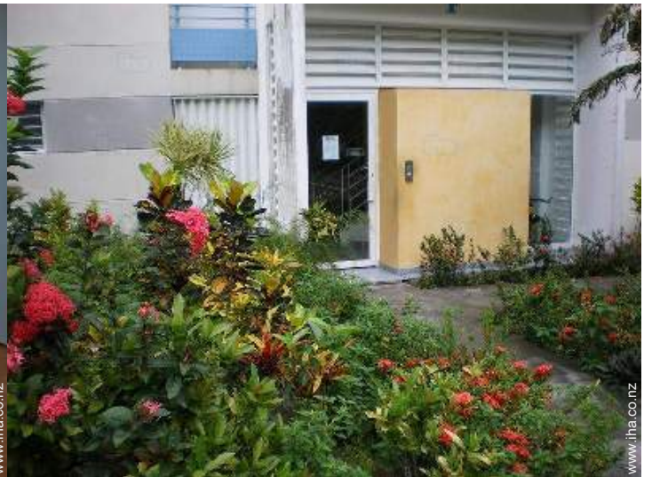
block of flats