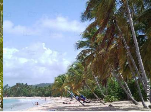
seaside pursuits nearby