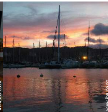
stretch of water