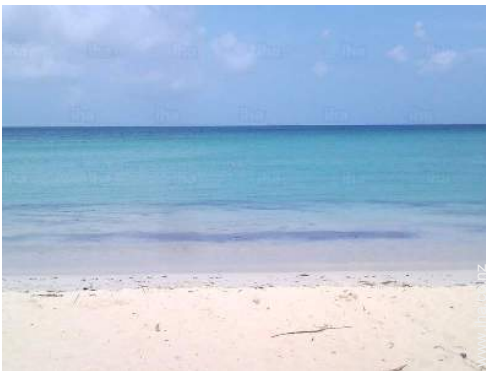
seaside pursuits nearby