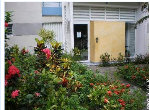
block of flats

Village centre 200m Town centre 300m Car rental 200m Boat rental 200m Breadshop 200m Local shops 100m Supermarket 300m Internet cafe 500m Post office 500m Bank 300m Cash point 300m Chemist 500m Doctor 300m Hospital 300m