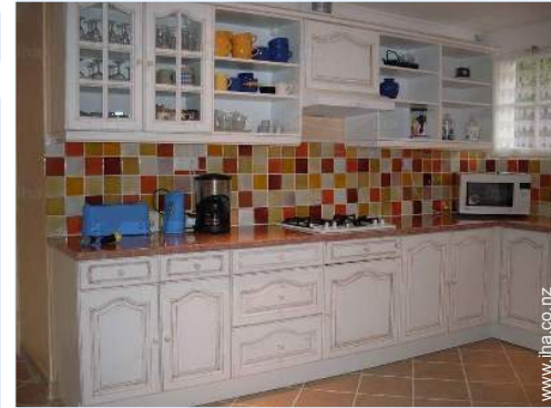
large american style kitchen