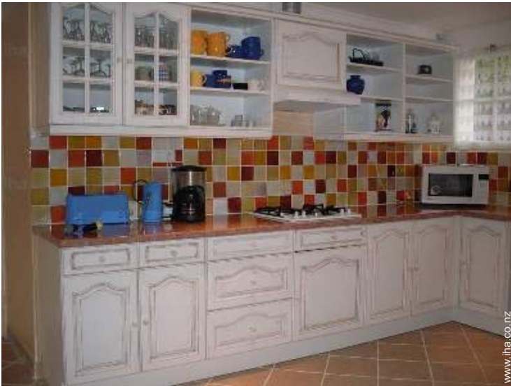
large american style kitchen