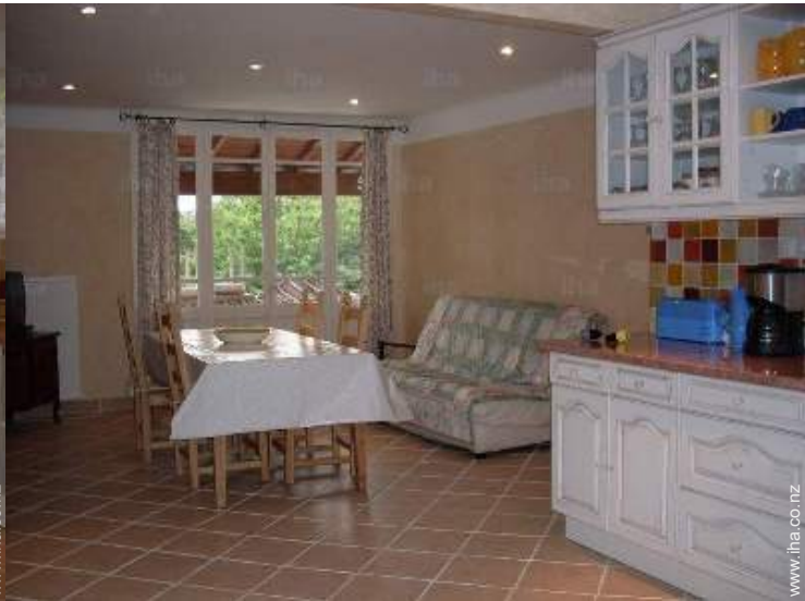
large american style kitchen