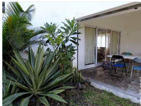
view from the veranda