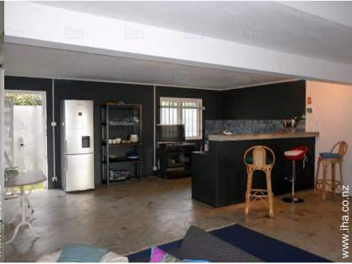
american style kitchen