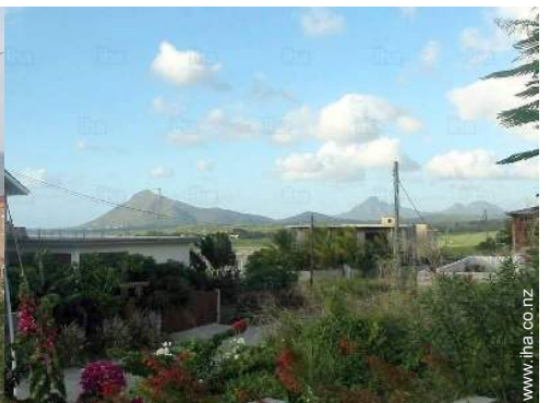
view over the mountain