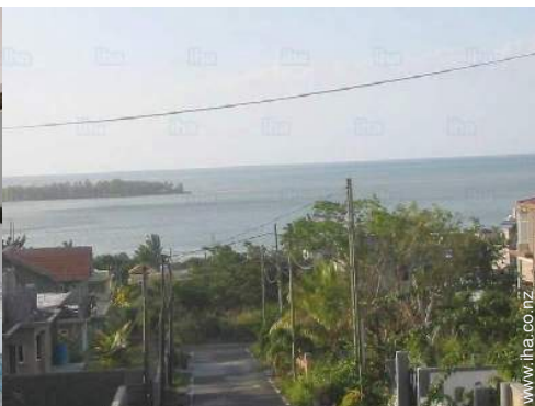
view over the sea