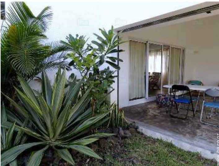
view from the veranda