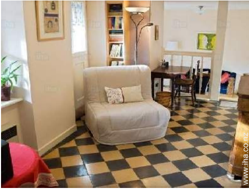
sofa bed(s) 1 pers