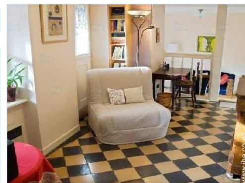
sofa bed(s) 1 pers

Garden table(s), 4 garden seat(s), parasol, 2 chaise(s) longue(s)