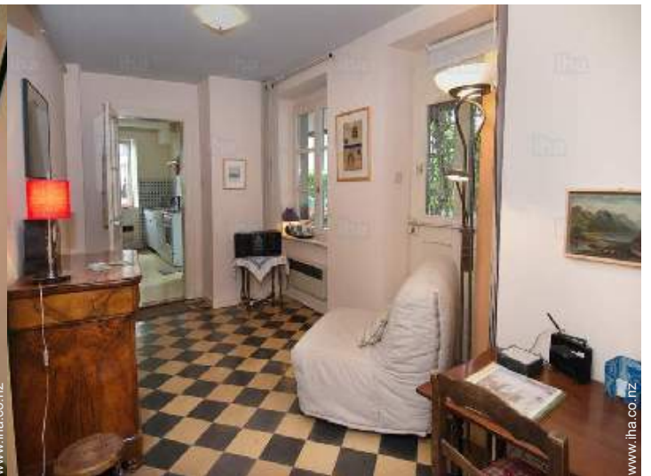
view from the sitting-room