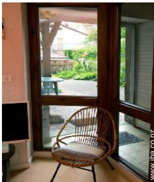
view from the sitting-room