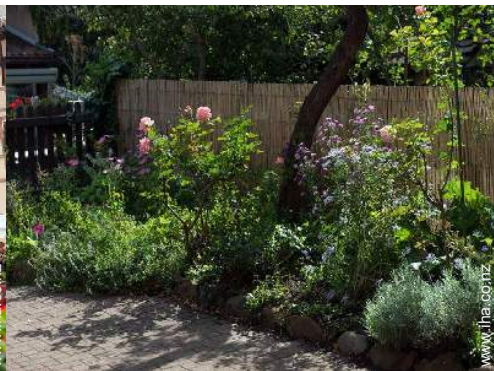
view from the garden/park