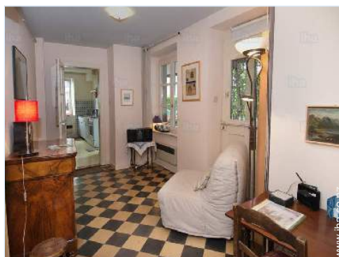
view from the sitting-room