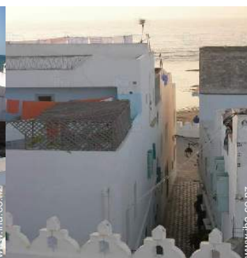
view over the ocean