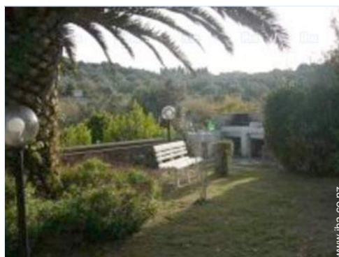
view over the countryside