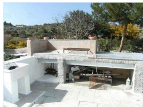
Equipment at the guest's disposal