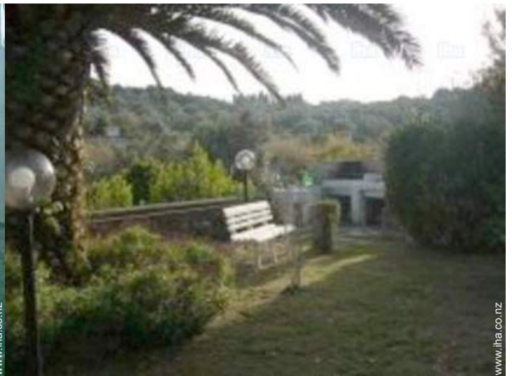
view over the countryside