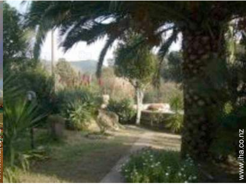
view over the countryside