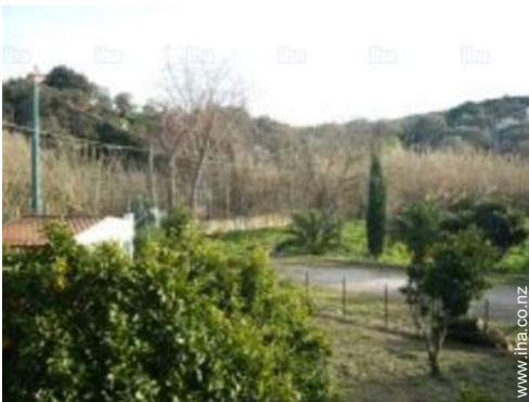
view over the countryside