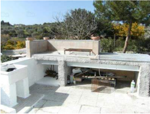
Equipment at the guest's disposal