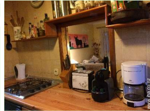
Interior comforts at guests disposal