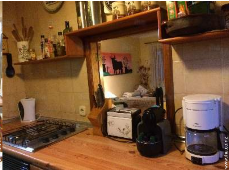
Interior comforts at guests disposal